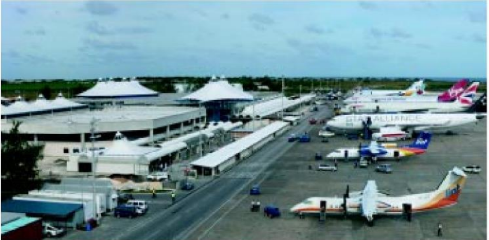
Tarmac at GAIA.