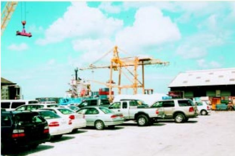
Motor Vehicles awaiting clearance through the Customs and Excise Department at the Barbados Port.

Following amendment of the regulations governing the importation of used or reconditioned cars, used or reconditioned cars could not be imported into Barbados if they were older than four (4) years and/or if they had an odometer reading over 50,000 kilometres (31,250 miles).