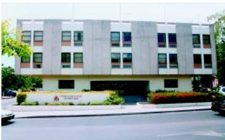
The Ministry of Foreign Affairs and Foreign Trade.

It is recommended that Networkers submit copies of filed income tax returns or proof of social security