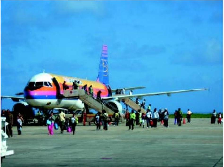
Barbadians return to the land of their birth.