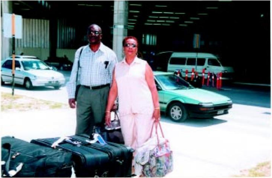
Barbados Networkers at GAIA.