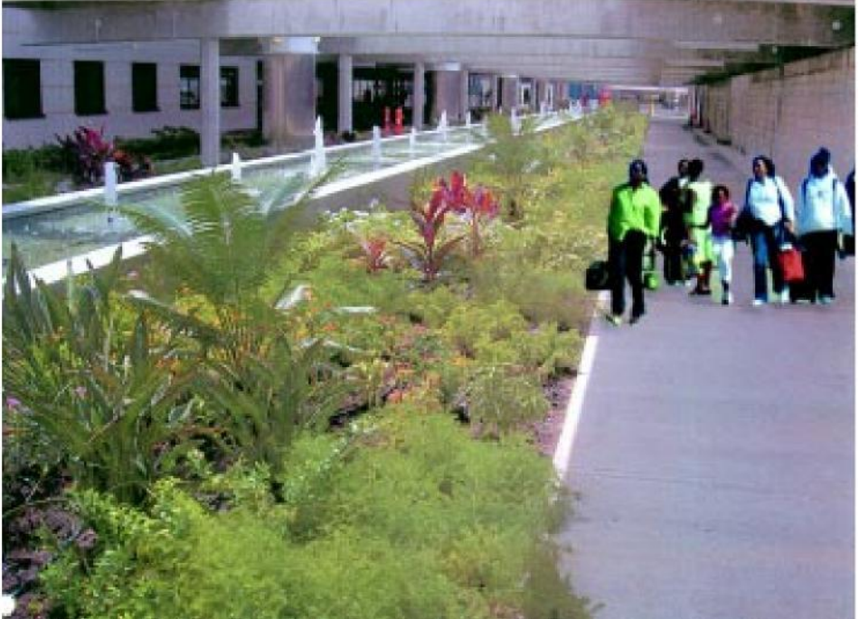
Passengers make their way to the Airport Terminal.