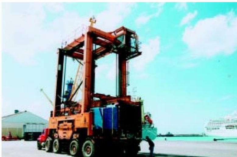
Container being handled at the Barbados Port.

Networkers are permitted a period of three (3) months before and three (3) months after the date of arrival in the country to import (not purchase) their personal and household effects, whether used or new, under the Programme. The Comptroller of Customs exercises discretionary power in respect of household and personal effects imported outside this three-month period. Applications for extension to this period must be made in writing to the Comptroller of Customs before the expiration of the period. Extensions are not automatic but are based on the merits of the particular case.